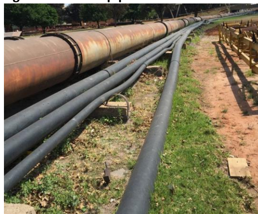
Figure 3: Current pipelines at Power Station

The following viewers will be exposed to visual alteration: