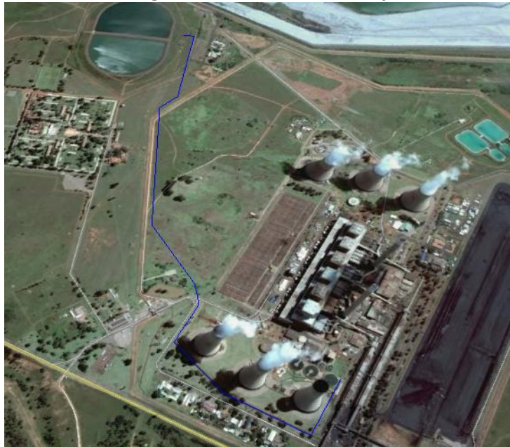
Figure 2: Alternative 2 site layout

The intended life for both alternatives is 35 years. Although the purpose of the pipeline is to supply Komati water to the WTP during the outage, the pipeline will add further flexibility for water management at Duvha Power Station. The pipeline can thus be used at any time in the future, if the supply of water to the power station is at risk.